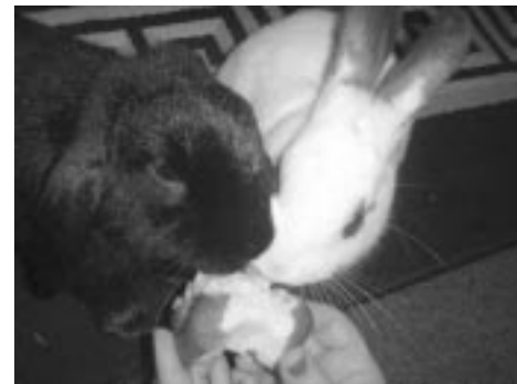
Coal and Phoebe

Standard Presort U.S. Postage PAID Permit No. 51 San Diego, CA