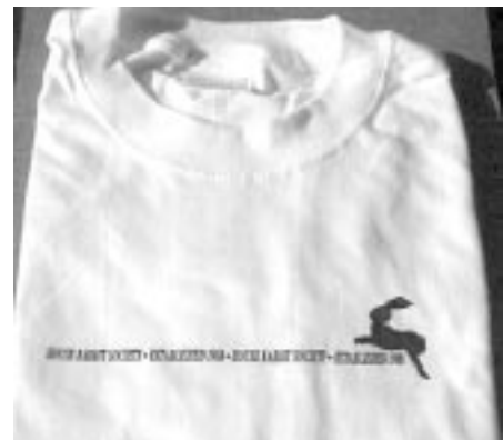
"Established" T-shirt Imprint says "House Rabbit Society - Established 1988"