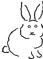
HOUSE RABBIT SOCIETY "Caffeine bunny"