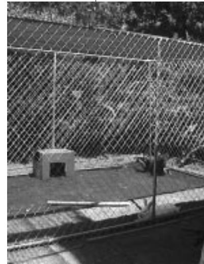
Aria and Skip explore the new exercise area at the North County Animal Control shelter in Carlsbad.