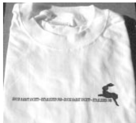
"Established" T-shirt Imprint says "House Rabbit Society - Established 1988"