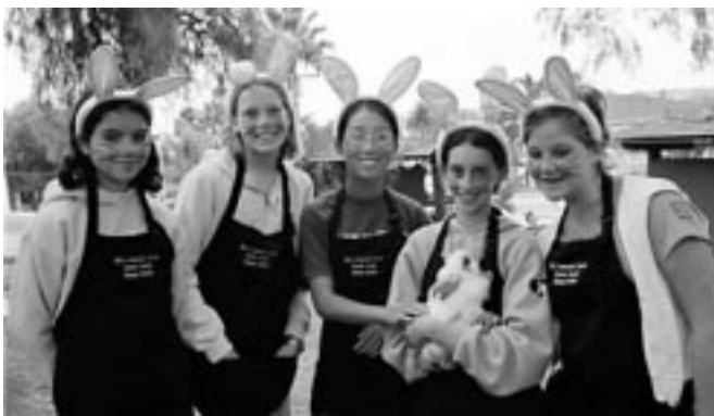
Kids Community Service volunteers from Rancho Coastal Humane Society